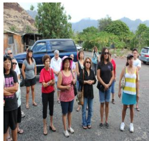
Ewa Orchid Members